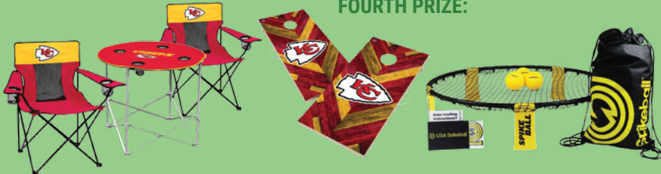
Tailgate Game Set (Custom NFL Chairs/Table Set, Cornhole Set and Spikeball Pro Kit)