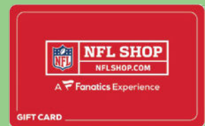
$300 Gift Card to NFLShop.com