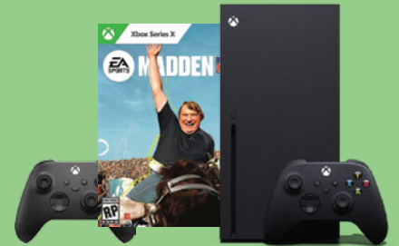
Xbox Series X + 2 Controllers + Madden NFL 23