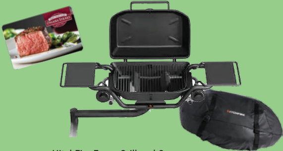
HitchFire Forge Grill and Cover + $200 Gift Card to Omaha Steaks