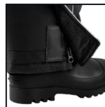
(Hook & Loop Leg Openings)